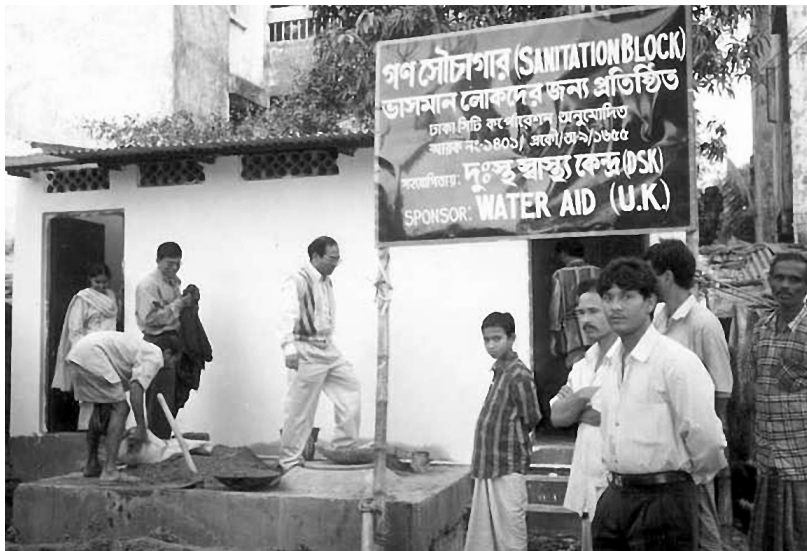
Photo 2: Sanitation blocks, which include latrine stalls, urinals and bathing space, are designed to serve up to 500 people