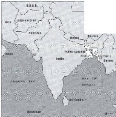
Map 1. Bangladesh and