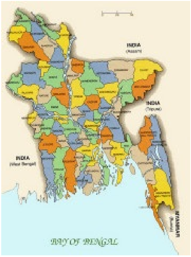
Map 3. Districts of Bangladesh